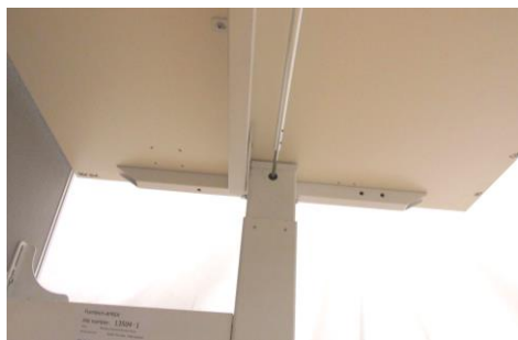
Manual winder desk top support frame