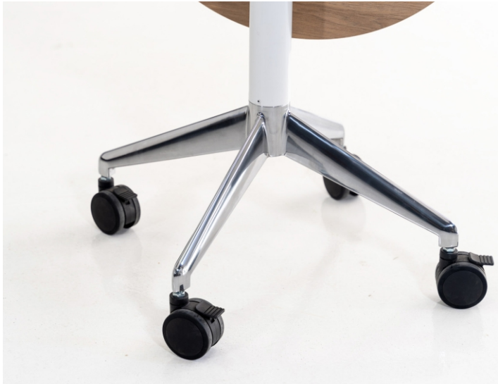
Four high quality lockable castors