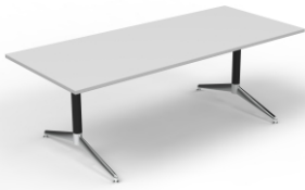
Rectangle Fixed with Glides Height: 720mm Length: 1500 - 2400mm Width: 750 - 1200mm