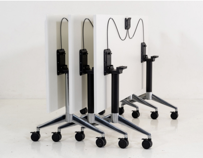
High nesting capability