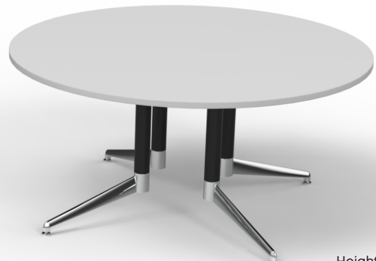
4-Post Base Round Fixed with Glides

Height: 720mm Length: 1200 - 2400mm* Width: 650 - 1000mm * Length above 1810mm includes support beam