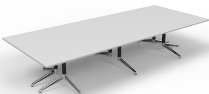
6-Post Base Fixed with Glides Height: 720mm Length: 2700 - 3600mm Width: 1300 - 1500mm