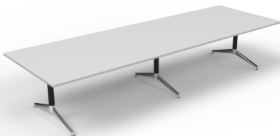
3-Post Base Fixed with Glides Height: 720mm Length: 2400 - 3600mm Width: 750 - 1200mm