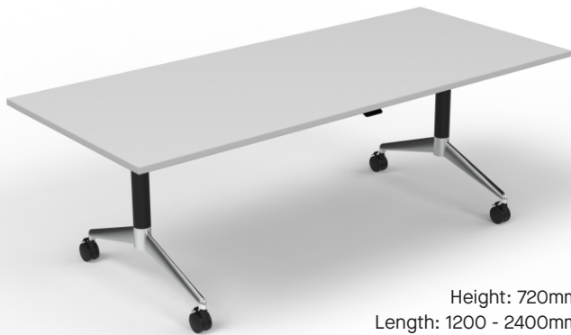
Rectangle Flip with Castors

Height: 720mm Length: 1200 - 2400mm* Width: 650 - 1000mm * Length above 1810mm includes support beam