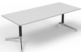
120 Degree Fixed with Glides Height: 720mm Length: 1500 - 2400mm Width: 750 - 1200mm