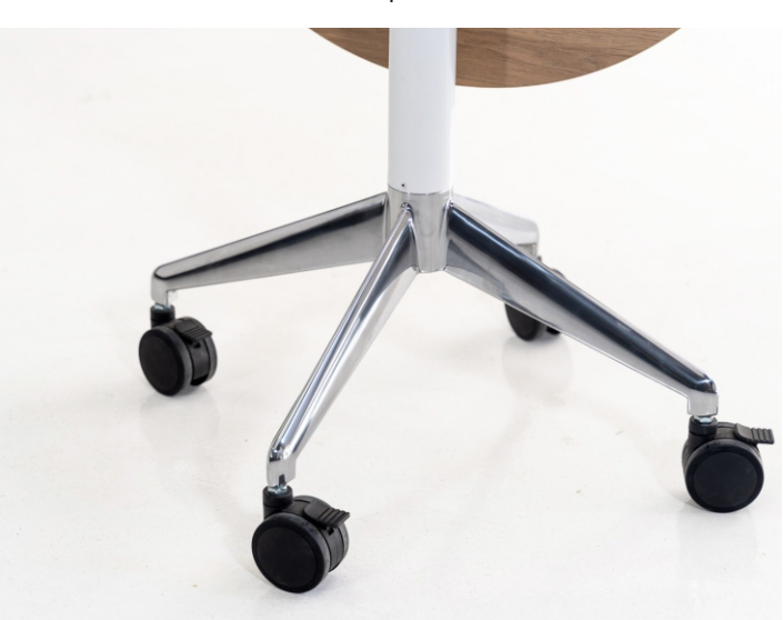
Four high quality lockable castors