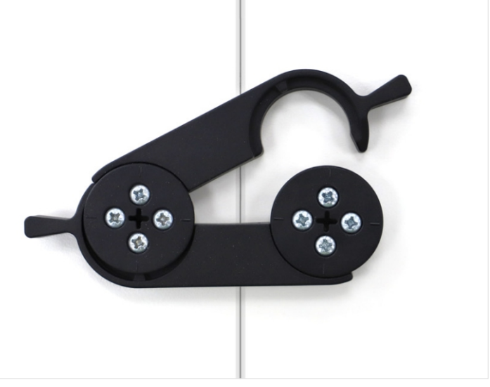
Linking mechanism table connector